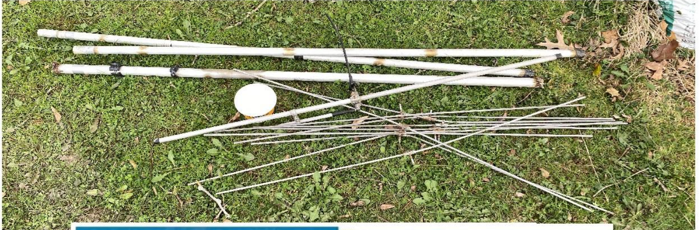
Stock Photos: FM Orientation vs SSB

Cushcraft A148-10S 11 Element 2m Beam (used) w/ instructions. It has been broken down for ease of transport as shown below. Needs new screws & nuts to attach elements to center beam and clamps to attach to mast pipe. This antenna is very similar to I0JXX 2M Yagi Antennas 18470-8-2 which sells for approx $280 new.