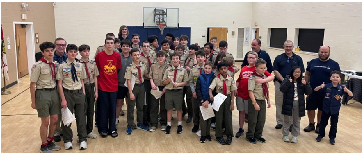
Troop 674 Scouts and RSC team at the close of the event.