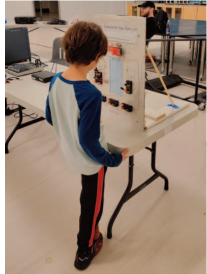
◆ (Right) One of our guests learning how current flows in a circuit.