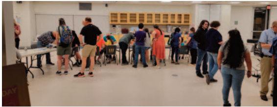
◆ In the STEM lab, learning about circuits.