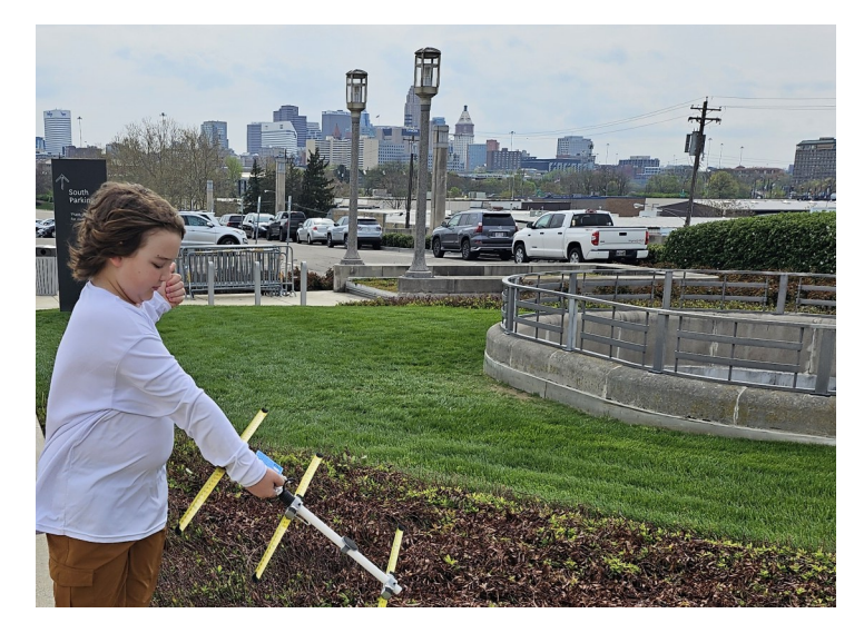
One young man enjoying learning Fox Hunting techniques.

We estimated that we had over 400 people interact with us and the various displays over the course of the five hours!