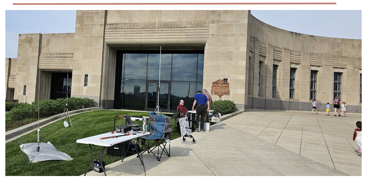
Outdoor setup featuring various RF configurations.