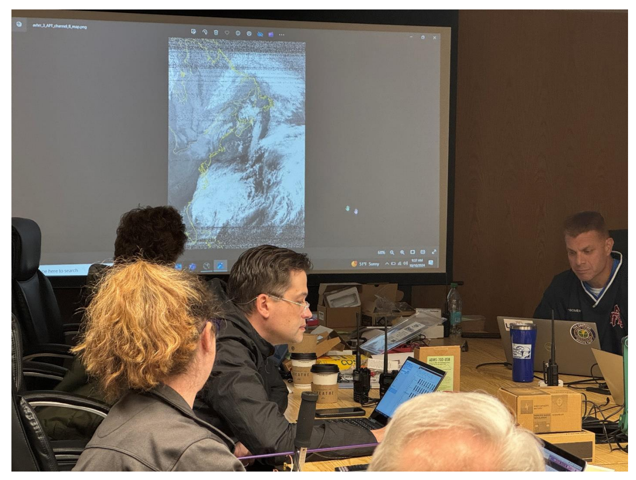
Teachers attending the ARRL Teachers Institute on Wireless Technology decode satellite images of Hurricane Milton.

On Thursday, October 10, as Hurricane Milton's remnants continued to roar across Florida, the group decoded GOES satellite images of the storm. As the decoded signals were converted to images, there were exclamations of amazement in the conference room that serves as the training center. "Wow!" said several teachers, almost in unison.