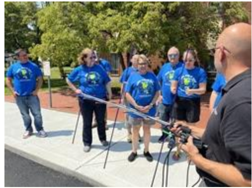
A group of teachers from the ARRL Teachers Institute of Wireless Technology learn about radio direction finding (foxhunting) in front of ARRL Headquarters.

Support for the institute is provided by donations from amateurs like you to the ARRL Education & Technology Fund .