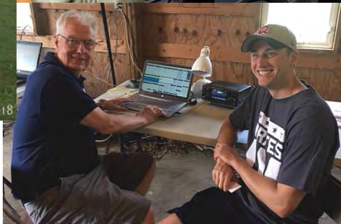
K8BF Field Day 2018