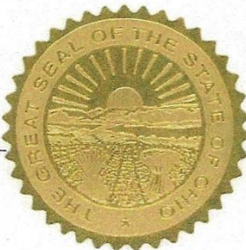
Jon Husted Lieutenant Governor