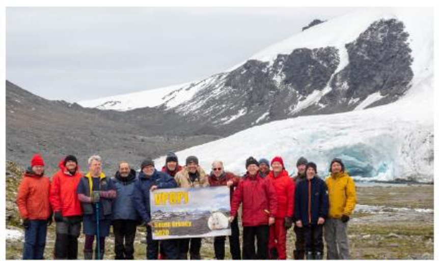
Members of the Perseverance DX Group put on the February 2020 VP8PJ DXpedition to South Orkney.

2020 Overview: To say the least 2020 was a DX year like no others. The Orkney Islands DXPedition VP8PJ, one of the top 20 most needed entities came on the air in late February. Then the Covid-19 (CV) pandemic set in worldwide in March. It made travel difficult, especially to rare DXCC entities in Africa and Oceania. Dozens of planned DXpeditions after that date will either be rescheduled to a later date or cancelled altogether. Also, most conferences and DX gatherings worldwide were cancelled. Suddenly call signs with suffixes like StayHome or StaySafe became common.