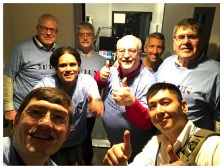
Here is the March 2020 4U1UN crew including (front row L-R) KO8SCA, K2QI, (middle row L-R) N2RJ, W2IRT, OH2BH (back row L-R) K1JT, G6CBR and VE7NY.

Digital Operations : Digital and especially FT8 took on more meaning in 2020. FT8 is known for its ability to copy very weak signals. Furthermore, it allows many smaller and low power stations to participate. During this low sunspot year, the higher bands were sometimes open for FT8 contacts when CW or SSB were too marginal. Lately I'm hearing many DXers on FT8.Note that FT8 has a learning curve and users are less likely to spot DX on the DX Clusters. FT4, a higher speed version of FT8 that is