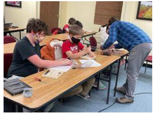
The Fauquier 4-H Ham Radio Club learning beginning circuitry skills by building code practice oscillators.

The Fauquier 4-H Ham Radio Club offers local youth ages 9 to 18 opportunities to explore STEAM through amateur radio communications and electronics projects. "An amateur radio license is not required to join, but the club strives to inspire and help members who are interested in getting their license achieve that goal," the proposal said.