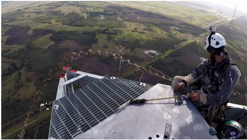
Above the clouds - antenna changeout view (YouTube)

Field Day is completed by the time you read this. Keep this in mind for next year. Sending 10 messages over RF from your site gets you 100 bonus points – including Winlink messages. I love to receive messages about your setup, stations, operating, or social activities taking place. These can be sent via the National Traffic System (NTS) or Winlink – K8JTK at Winlink.org – to my station. Field Day rules state messages must leave via [ham radio] RF from the site (7.3.6). It does not state “formal messages” be in any particular format or utilize any particular network. A message to the SM or SEC must be in radiogram format and leave via RF or