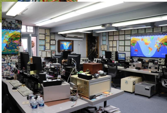
K3LR operating positions

Cincinnati, closer to 5+ hours each way with and food. Tim is an excellent host as always amazing engineer. He built the station over and has one of the quietest noise floors ever see. As he'll tell you, it didn't come He's got really good stories including one involving a late-night party. I'll leave that him to tell! It was great to get out of the a day and hang out at a superstation with the from VOA.