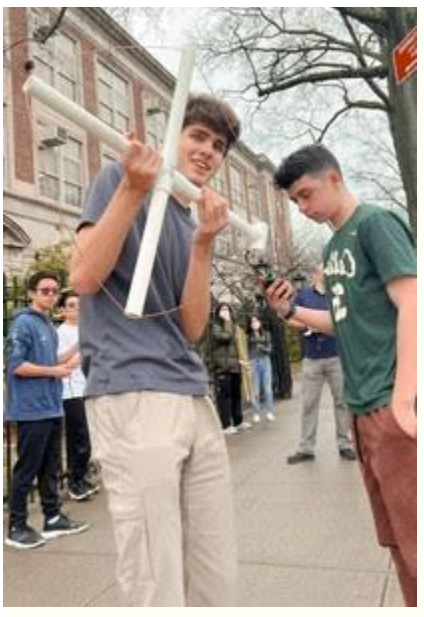
Students with a homemade antenna.

find the full listing of ARRL-sponsored forums, exhibits, and activities. Hamvention is May 17 - 19, 2024, at the Greene County Fair and Expo Center, in Xenia, Ohio; hamvention.org .