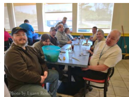
◆ April Brunch Bunch group