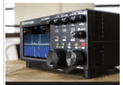
Want easy FT8? Click to learn more.

FT8 + FlexRadio<sup>™</sup> A match made in digital heaven.