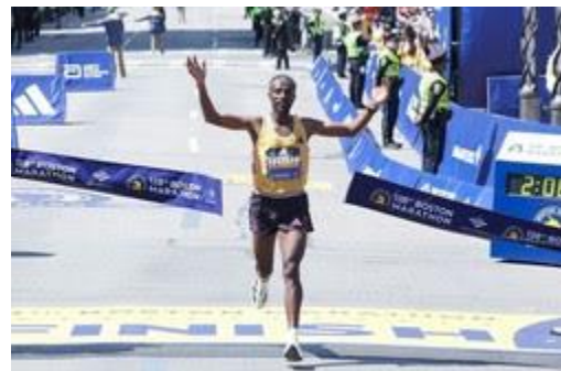
Sisay Lemma wins the 128th Boston Marathon with a time of 2:16:17. Hundreds of radio amateurs volunteered to provide communications for the historic race.