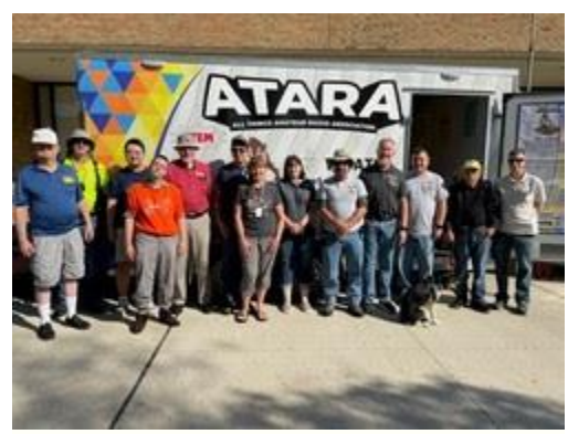
Members from W8LT and W8ATR outside the ATARA STEM trailer.

and the All Things Amateur Radio Association, W8ATR, provided information and hands-on STEM experiences for nearly 400 attendees. The W8ATR Mobile STEM Trailer, funded by a grant from the ARRL Foundation, included a CW oscillator, a display about the history of Morse code, and signage explaining the history of wireless technology and radios. Three Snap Circuits® stations were set up for visitors to build an FM radio, and there was a working replica of a spark-gap transmitter. The trailer also featured a complete amateur