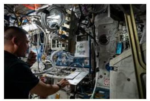
NASA Astronaut Kjell Lindgren, KO5MOS, participates in ARRL Field Day 2022 aboard the International Space Station.

Radio enthusiasts are welcome to download the message and follow along with the event, but it is asked that all hams refrain from using the repeater for voice contacts during the event. This is a special experiment conducted through ARISS and ARRL. After the experiment has concluded, normal operations of the repeater should resume in voice mode only.