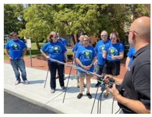
A group of teachers from the ARRL Teachers Institute of Wireless Technology learn about radio direction finding (foxhunting) in front of ARRL Headquarters.

Support for the institute is provided by donations from amateurs like you to the <u>ARRL Education & Technology Fund</u>.