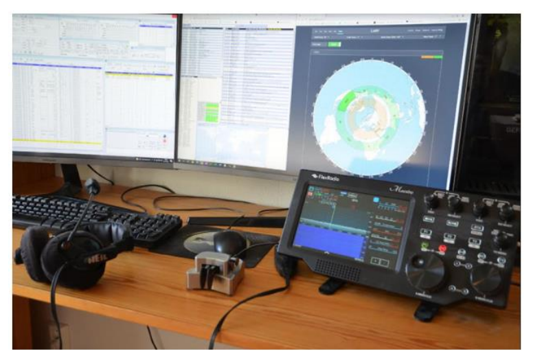
My 'shack' - Just a Maestro with keyer connected in my home

LB1G: My father was licensed as LA5QK in 1965, and my brother and I soon got interested in what he was doing. We started up listening to an old receiver with a long-wire antenna on 80 meter in the evenings and were soon hooked. This was even long before I