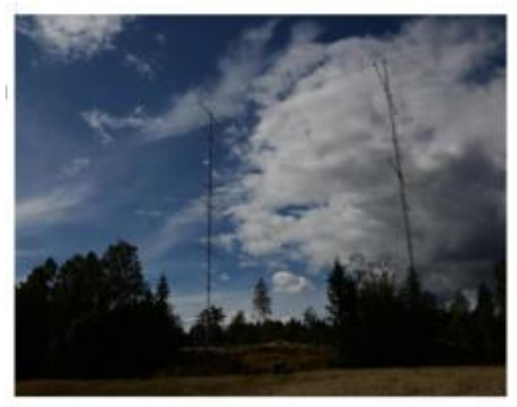
Figure 3 The new 56 custor transs fully equipped

CU on the bands. 73 de Jan / LB1G <u>lb1g@arrl.net</u>