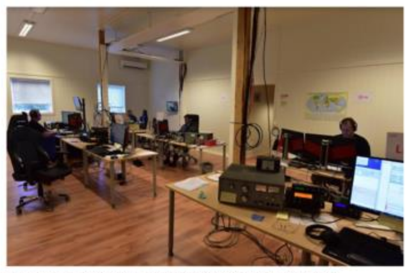
Figure 1 From left: LBSIB, LA3BO, LBSCG and LB1GB Multi-Multi in CQWPX CW.