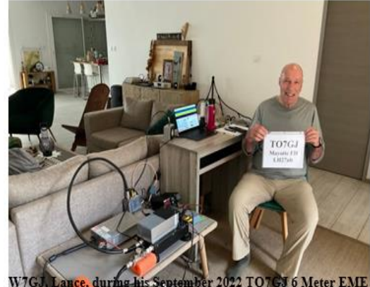
DXpedition to Mayotte Island. He hopes to go to ZD9 in 2023.

10 and 12 Meters: These bands are beginning to support good DX. Vigilant DXers are taking advantage of the improved radio propagation. There