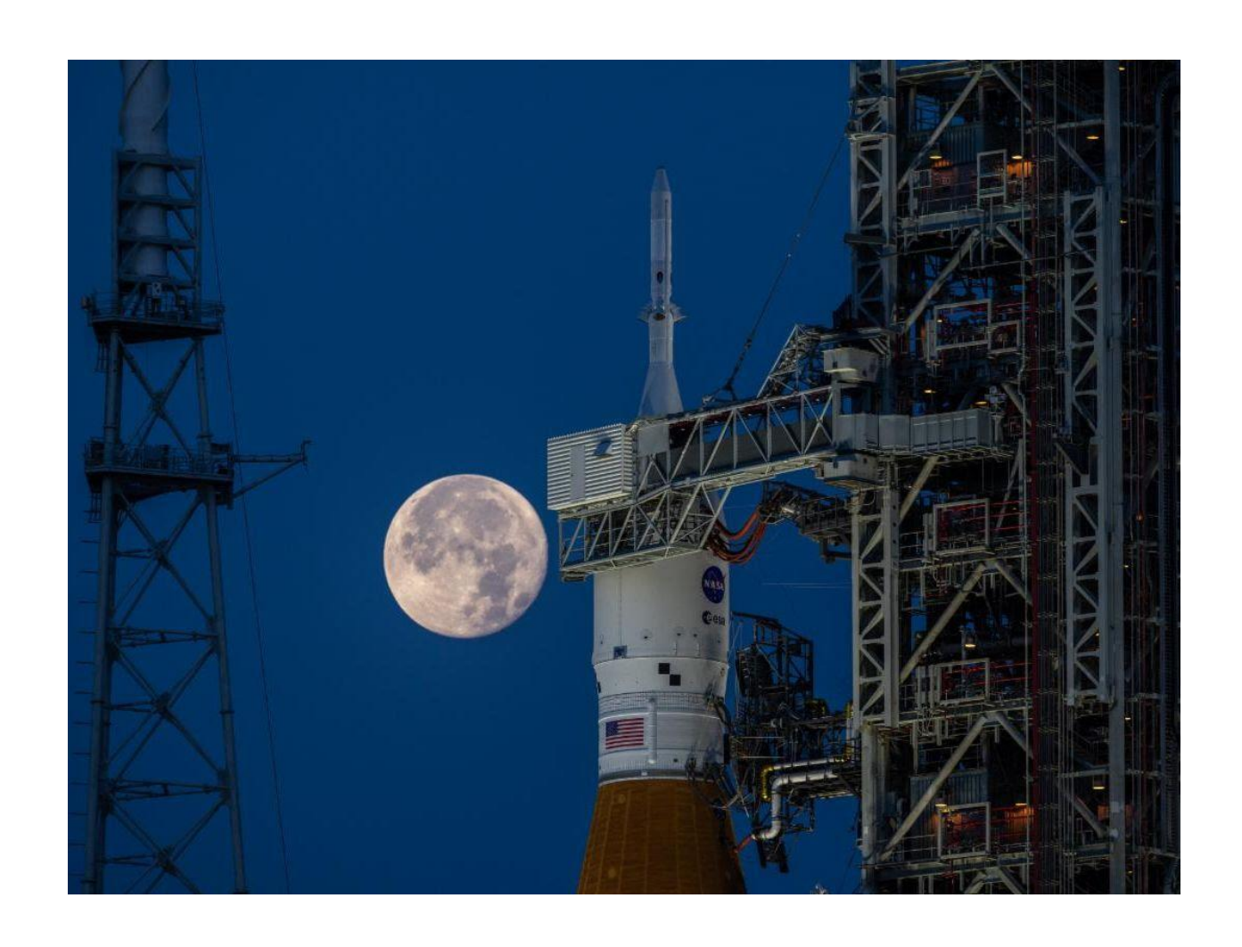
Artemis I Becomes a Time Capsule for Trip Around Moon