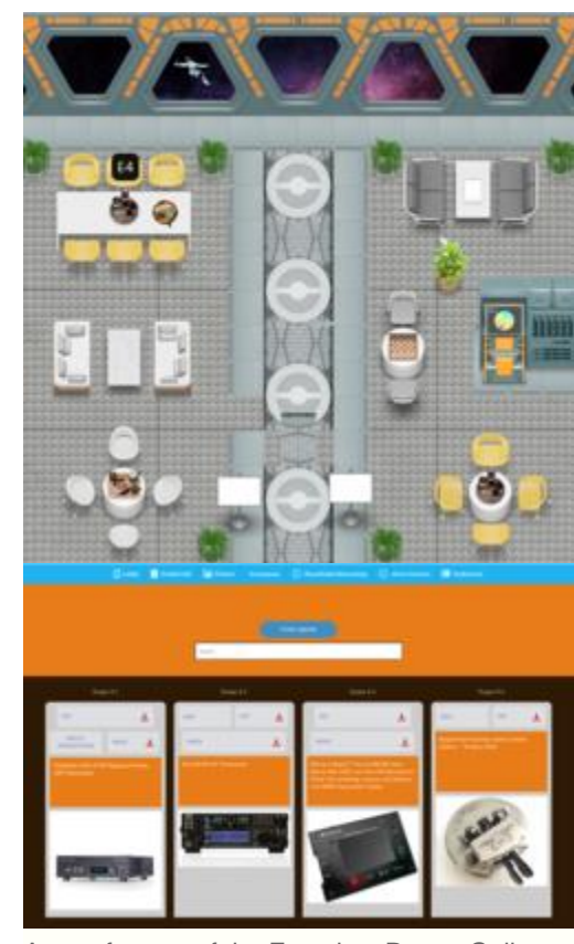
A new feature of the Expo is a Poster Gallary Hall which will include a product showcase and interactive projects from radio amateurs.

Sponsor and exhibitor opportunities are still available. The $10 ticket for the Expo will go on sale in August. Anyone can attend the Expo from anywhere in the world, over the internet. For more information go to <a href="mailto:qsotodayhamexpo.com">qsotodayhamexpo.com</a>. ARRL The National Association for Amateur Radio<sup>®</sup> is a QSO Today Virtual Ham Expo Partner.