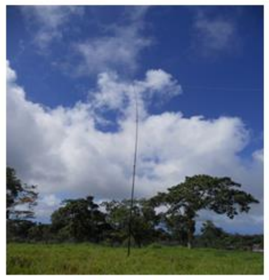
5W0GC's Vertical antenna on 180/80/40m during a windstorm (Part 2-Vanuatu in our Next Edition)

They traveled with extra luggage, which included two vertical antennas from 10-40m and a low frequency receiving antenna donated by Array Solutions. I asked them to activate the bands immediately on their arrival at the motel in Vanuatu