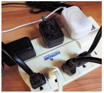
Small household "wall warts" are typically noisy switching power supplies.

The FCC Technological Advisory Council (<u>TAC</u>) -- a Commission advisory group -- <u>initiated an inquiry</u> in 2016 looking into changes and trends to the radio spectrum noise floor to determine whether noise is increasing and, if so, by how much. The TAC had encouraged the FCC to undertake a comprehensive noise study in 1998, and cautioned the FCC against implementing new spectrum management techniques or initiatives without first concluding one. In 2017, the FCC Office of Engineering and Technology (OET) invited comments on a