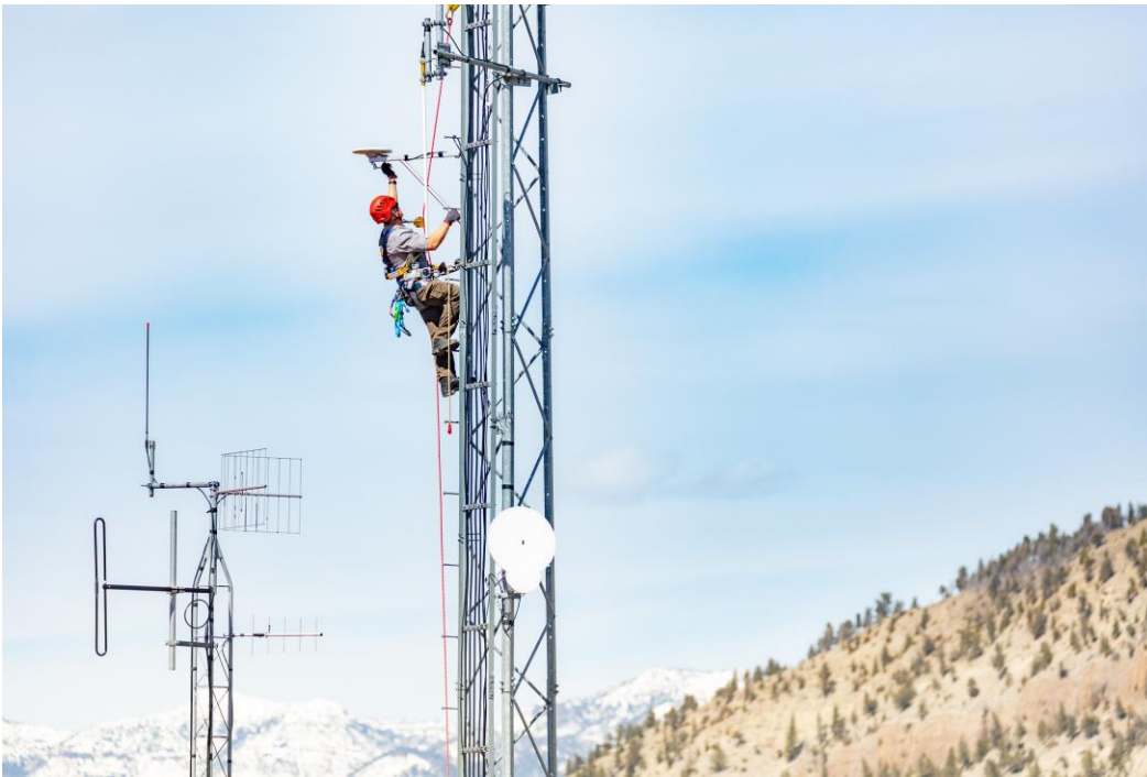
A radio technician works on a tower in scenic terrain in this photo from the job posting.