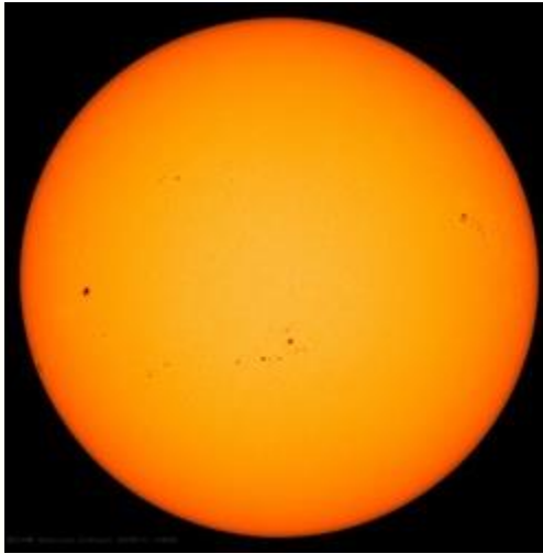
This solar disk image was taken on January 11, 2024.

A weekly, full report is posted on ARRL News .