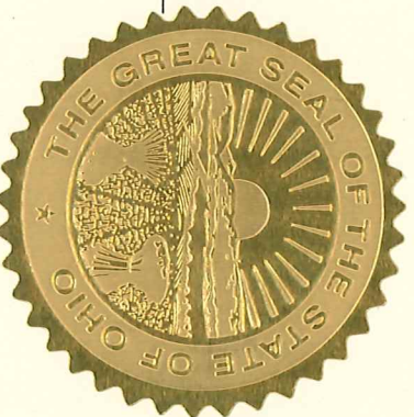
Jon Husted Lieutenant Governor